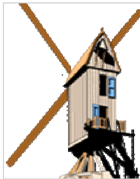
NORFOLK INTERNATIONAL INC