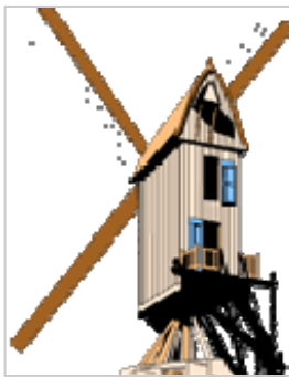
NORFOLK INTERNATIONAL INC