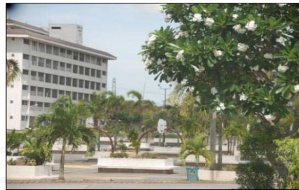
The Sisters of Mary School Girls Complex in Silang, Cavite

Established in the Philippines in 1985, the school, along with a Boystown school also in Silang, offers free education to the poorest of poor children who have graduated primary school in Luzon. On referral by their local Catholic Church, talented children undertake a rigorous assessment before being accepted for a four year High School education, which aims to provide a mix of an academic curriculum along with vocational studies to enable students to enter the workforce and/or progress to higher education. The Girlstown has a capacity of some 3,500 students, who board at the school throughout the academic year which unusually runs from January to December each year, with only 2 weeks off for Christmas and the New Year when students return home. The school is very well endowed, receiving generous donations from around the world, which covers the annual full board education cost of some PHP50-60,000 per student. There are also Girlstown and Boystown schools in Cebu, which provide similar High School opportunities to children from the Visayas and Mindanao.