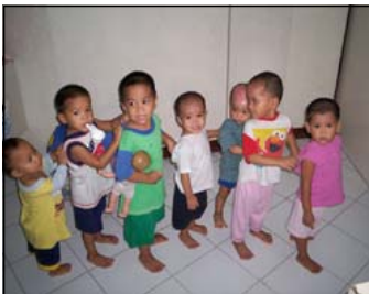
Children at JASON'S HOME

You can know more about Gentle Hands and their work at www.gentlehands.typepad.com .