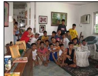
DAVID Boys Rehabilitation Program